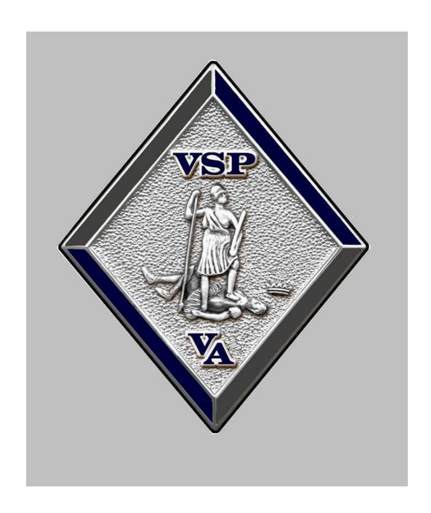
Critical Incident Stress Management Team